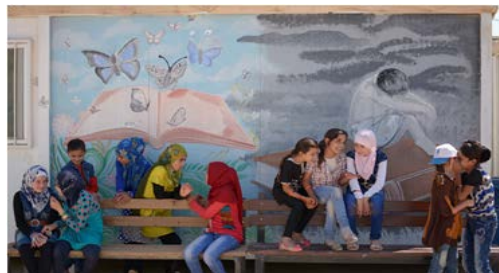
Zaatari Syrian refugee girls gather for a meeting of TIGER (These Inspiring Girls Enjoy Reading) programme which targets refugee girls who have dropped out of school, or who are at risk of dropping out of school.

Strengthening education systems is a core component of the refugee education response as it allows education systems to better respond to the increased needs of Syrian and host communities children.