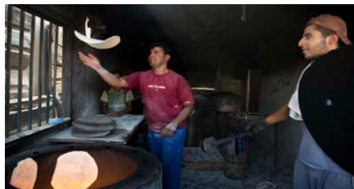
General views of stores on the Champs Elysees, in Zaatari refugee camp.

Assessments by sector actors in Lebanon will also allow for better understanding of the impact of the crisis on the agricultural labour market.