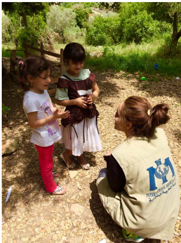
Children at an informal tented settlement in Beirut

Prior to assessments, International Medical Corps' Program staff visited the selected communities to seek approval from community leaders or PHC directors to conduct data collection. Additionally, where possible women meeting criteria for inclusion in the BA were recruited ahead of time by a Community Health Worker (CHW) to gather in a central location (either a central tent, room, or clinic). During data collection, data collectors approached each potential participant (either at her home or in the central location), found a semi-private place to conduct the interview, introduced the study and offered informed consent. Those who consented to be part of the study were then screened to determine Doer or Non-Doer status, before proceeding with the survey interview.