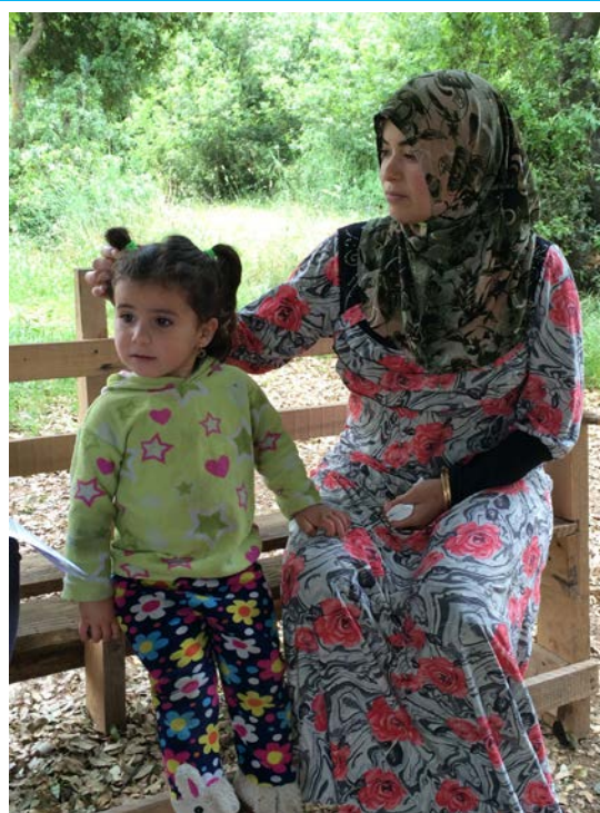
Mother and child at an ITS in Beirut

A Barrier Analysis (BA) is a rapid assessment tool used to identify the factors that are preventing a target group from adopting a preferred behavior, as well as identifying the facilitators or motivators to adopting the behavior. The BA approach is based on the Health Belief Model and the Theory of Reasoned Action, and explores up to 12 recognized common determinants of behavior adoption. The approach involves a cross-sectional survey, carried out among a sample of 45 “Doers” (those who practice the behavior) and 45 “Non-Doers” (those who do not), for a total of 90 participants per BA. Individuals are first screened and classified according to whether they are Doers or Non-Doers, and then asked questions according to their classification. Syrian mothers who should be practicing the behaviors in question were interviewed in order to identify which of the 12 determinants of behavior change are preventing Non-Doers in this population from adopting the behavior, as well as which determinants are facilitating adoption of behaviors among Doers.