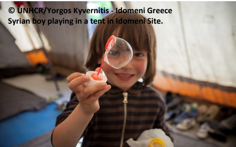
Idomeni Greece Syrian boy playing in a tent in Idomeni Site.