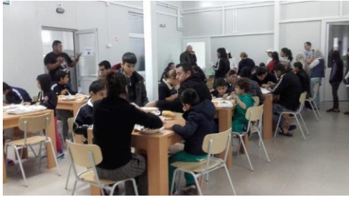
Lunch time in the RC Dimitrovgrad (Serbia) @UNHCR, 29 Nov 2016

On 30 November, the new Reception Centre in Dimitrovgrad accommodated 65 asylum seekers, majority from Iraq (65%) and Afghanistan (26%). Over half of them are children.