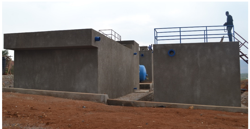
Permanent Water Treatment Plant in Mahama refugee camp

Read More: http://www.unhcr.org/rw/836-mahama-burundian-refugees-get-a-new-permanent-water-treatment-plant.html