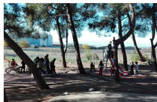
Refugee children enjoy the new playground constructed in Diavata site through one of the community-based interventions supported by UNHCR © UNHCR / November 2016