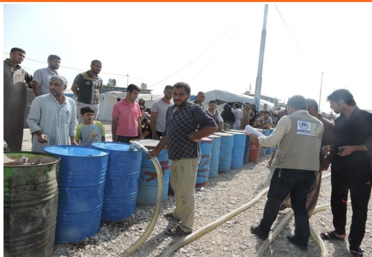
Kerosene distribution inside Arbat Refugee Camp - Sulaymaniyah Governorate

In Dohuk, the Domiz 1 camp management team coordinated with BRHA and the Governor's Office to install 8 generators (500 KVA capacity each) that would enable refugees to have 24 hour electricity against nominal fees similar to communal practices in the host communities.