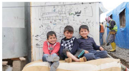
Domiz 1 Refugee Camp, Duhok Governorate

Additional opportunities for resettlement and other forms of admission, including humanitarian visas, academic scholarships, and labour mobility schemes, are also needed.