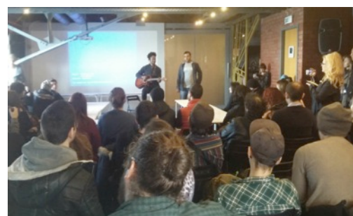
Renowned British musician Brian Farrow joined the photography/documentary workshop for refugee children titled "Life through the eyes of the others", organized at the Thessaloniki Film School, in collaboration with UNHCR © UNHCR / December 2016