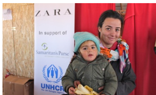
Happy asylum-seeker mother and daughter at Nea Kavala site wearing hats and scarves donated to UNHCR by ZARA © UNHCR / December 2016

"Our lives changed dramatically after receiving the heaters! Before, we used to burn plastic and anything else we could find to warm up at least a little bit" said Manaa Al Hussein, father of 43 years old from Syria, now living in a UNHCR prefab house in Nea Kavala site © UNHCR / December 2016