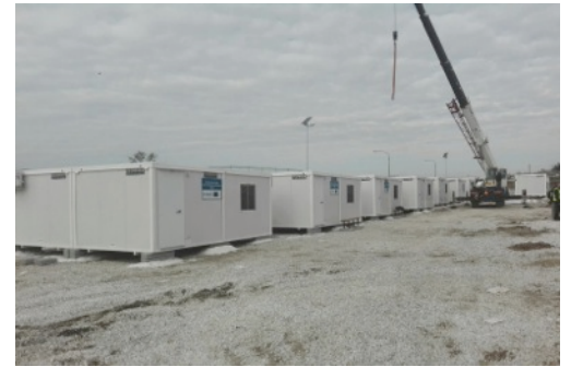
UNHCR prefab houses are installed in Diavata site as part of the winterization plans © UNHCR / December 2016