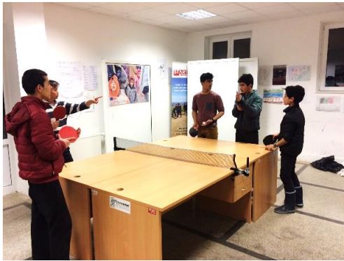
Boys playing table tennis in RC Preševo (Serbia), @UNHCR, 28 February 2017