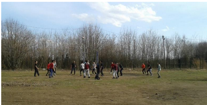
Refugees and migrants playing volleyball in a Transit Centre, Principovac (Serbia), 01 March 2017

Krnjaca Asylum Centre accommodated 1,052 asylum-seekers, On 04 March, UNHCR Representative, together with the State Secretary of the Ministry of Labor, Employment, Social and Veteran Affairs, attended a media event by ADRA at the Community Centre close to Krnjaca, where asylum-seeker and local children join for recreational and educational activities.