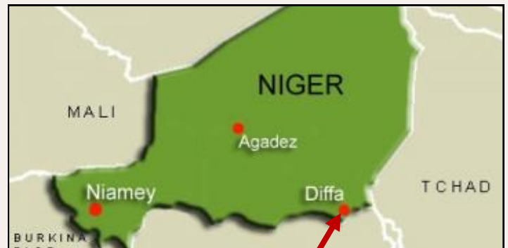
Region of Diffa.