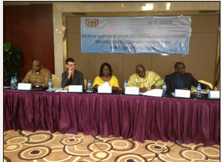
Validation workshop for the study on documentation for displaced persons in Northern Nigeria in the Diffa Region.

Among the recommendations of the study was the need to revise national legislations with regard to nationality in order to strengthen the prevention of statelessness but also to adopt, at the ECOWAS level, principles of harmonization of the national legislations re-