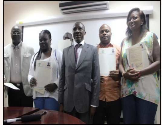
Gnénéma Mamadou Coulibaly, Minister of Justice of Côte d'Ivoire, symbolically giving an Ivorian nationality certificate to 6 petitioners

To date, nearly 113 100 applications for Ivorian citizenship by declaration are being processed according to the Ministry of Justice, Human Rights and Public Liberties.