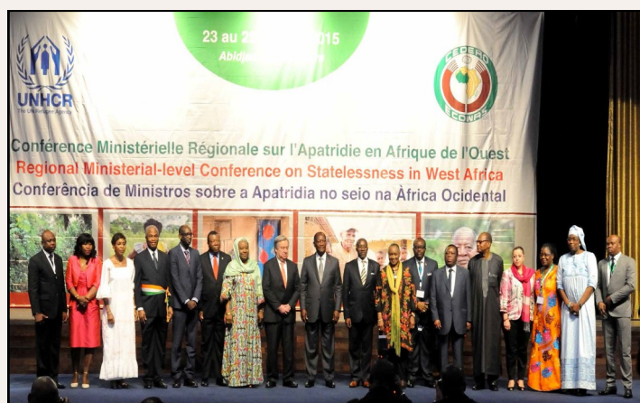
The documents, conclusions and recommendations of the conference are available via this link: data.unhcr.org/ecowas2015/

Through these commitments, West Africa is resolutely engaged in the global campaign against statelessness and shows a path to the continent's other regions.