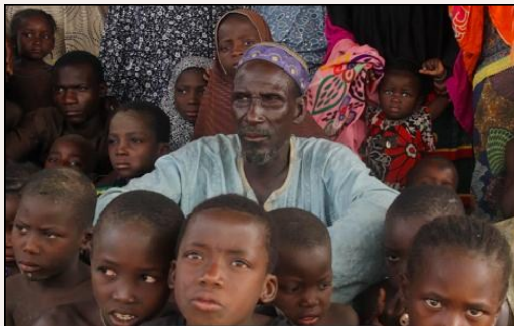
Inhabitants of Bird Island.

Concerning the area retroceded by Niger to Benin (Birds Island), the municipality of Karimama also conducted a census on people living here. On 18 July 2015, 180 people were identified (37 women, 28 men and 115 children). An early sustainable solution is being found for these people, as adults were considered for the establishment of the permanent computerized electoral list (FISA) of Benin.