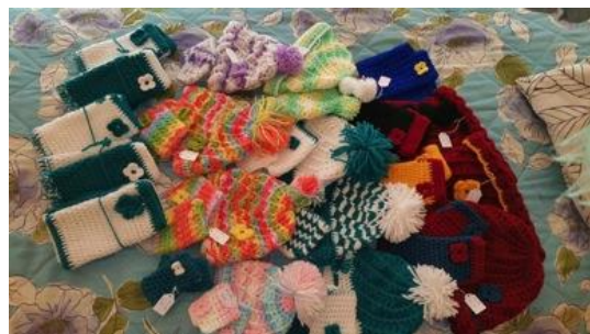
The colorful results of a knitting community-based project realized by asylum-seekers hosted under UNHCR's accommodation scheme in Thessaloniki