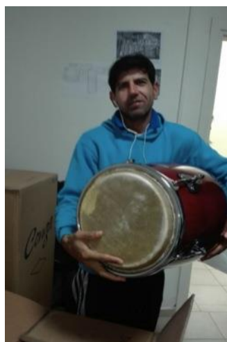
An Afghan asylum-seeker musician shows happiness when receiving drums and other musical instruments from UNHCR, as part of a community-based intervention in Diavata site