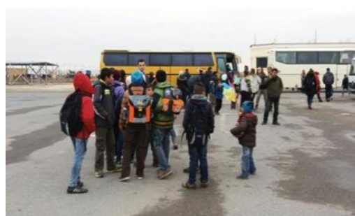
Second day of school for 150 refugee children from Nea Kavala site. Four schools receive the children: one in Polykastro, two in Axioupoli and one in Platania © UNHCR / 31 January 2017