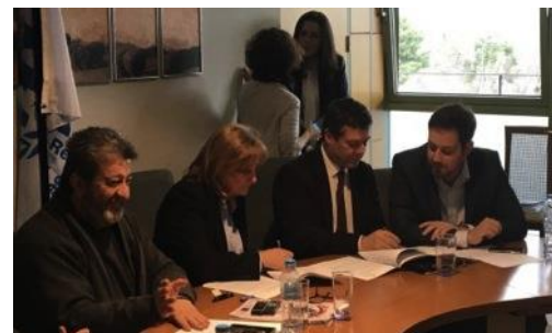
UNHCR and Thessaloniki Municipality renew agreement on accommodation for relocation candidates and other vulnerable asylum-seekers © UNHCR / 17 January 2017