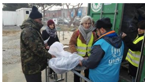
UNHCR distributing thermal blankets in preparation of the cold wave at Diavata site © UNHCR / 5 January 2017