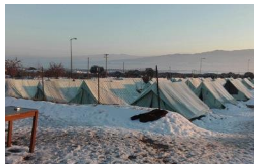
Empty tents in Vagiochori, after a UNHCR evacuation to improved shelter © UNHCR / 12 January 2017