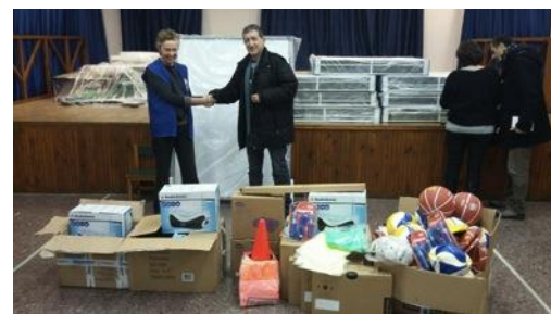
UNHCR donates IT equipment and sports educational material to schools in Thessaloniki, Lagadikia and Profitis

that are attended by refugee children. During their discussions with the Head of UNHCR Office in Thessaloniki, the Principals of Primary and High Schools of Lagadikia, Profitis and 67th Primary School of Thessaloniki expressed both their gratitude to UNHCR for the donations of information technology and sports equipment, as well as their strong will to continue the successful cooperation. In western Greece, UNHCR donated 30 schoolbags and 30 school kits to 30 refugee children attending secondary schools in Ioannina and residing in Exohi and Egnatia hotels.