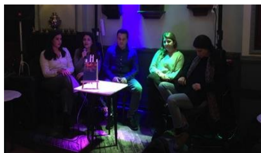
Thessaloniki public was moved by the testimonies of unaccompanied children in Greece collected by the Hellenic Theatre/Drama & Education Network and UNHCR in the book "Monologues across the Aegean Sea" 29 January 2017

i The Blue Dot project was launched in February 2016 by UNHCR, UNICEF and ICRC, aiming to step up protection for the growing number of refugee children and women in Europe. The first Hubs were set up along the Balkan route with a view to provide safe spaces for vulnerable families on the move towards north Europe, and in particular for children, many of whom are unaccompanied or separated from their families. After the closure of the Balkan route, the Blue Dot Hubs address the refugee population remaining in countries that once were mainly transit points. The Hubs provide safe areas for children and their families, mother and baby spaces, playgrounds, protection, counselling and other vital services, all in a single and easily identifiable location.