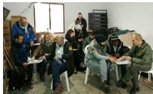
Authorities and partners attend a Site Management Support training provided by UNHCR at Alexandria site 17 January 2017