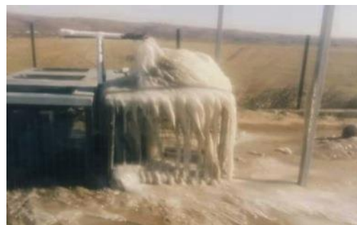
Frozen water blocks due to extreme cold in Nea Kavala 9 January 2017