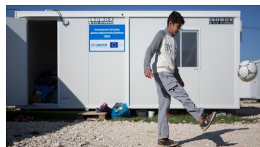
A boy plays football outside his prefab house in Katsikas site 22 November 2017