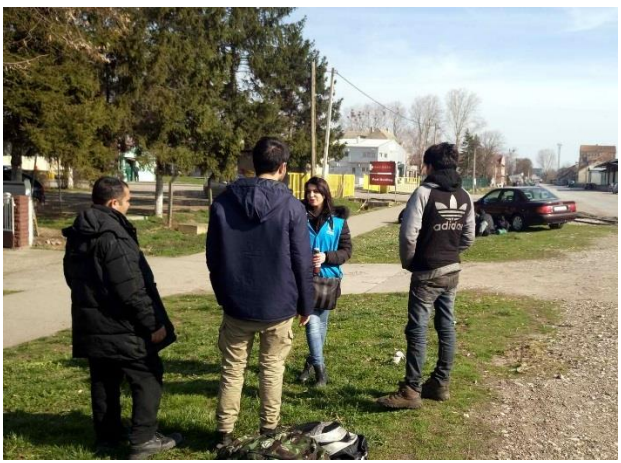
Counselling on asylum and registration, Sid (Serbia), 17 March 2017

Krnjaca Asylum Centre accommodated 1,009 asylum-seekers. 1,037 refugees and migrants (including 337 unaccompanied or separated boys) were sheltered in Obrenovac. UNHCR and partners continued supporting the rapid refurbishment of capacities in Obrenovac, as well as regular medical and protection services.