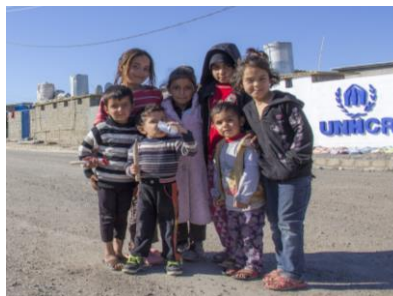
Gawilan camp, Duhok

38% = 88,863 live in 9 camps and 62% = 144,361 in non-camp/urban areas. 97% = 225,203 live in Kurdistan Region-Iraq (KR-I): in Erbil Duhok and Sulaymaniyah and 3% = 8,021 live in other locations in Iraq.