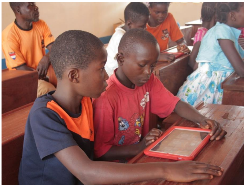
Refugee children from Mole camp during a French grammar lesson in the Instant Network Classroom