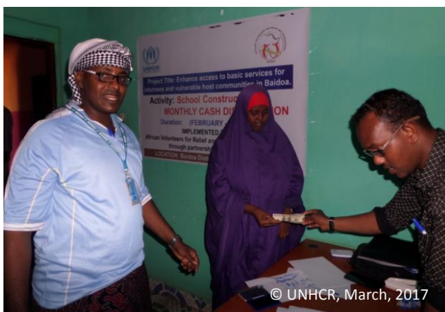
Beneficiaries receiving incentives for the rehabilitation of a school in Baidoa.