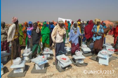
UNHCR providing CRI kits to people affected by drought