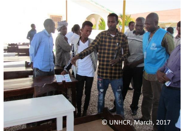
Graduation ceremony in carpentry [left] and products of IDP after the training [right].