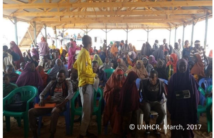
Returnees arrived at the way station [left] and received information on the areas of return [right] in Kismayo.