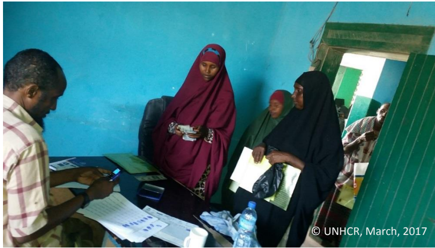
Returnees receiving re-installation grants upon their arrival at the Home Way Station in Kismayo.