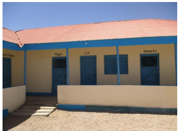
Police Post in Aden Suleiman IDP settlement in Togdheer region constructed with UNHCR funding.