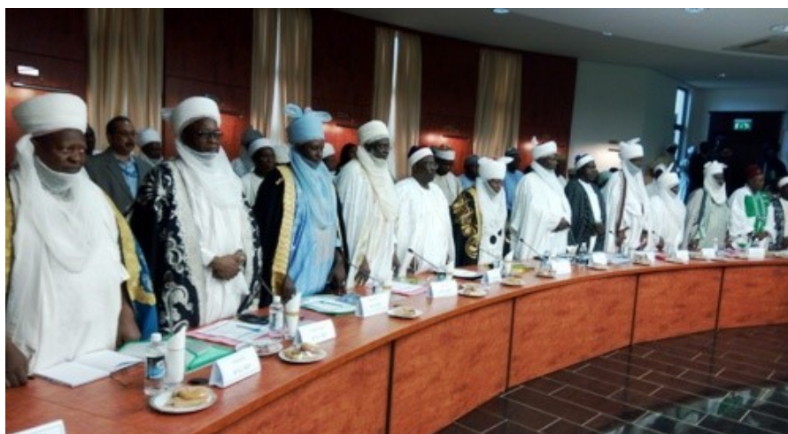
A cross-section of Northern Traditional Leaders Committee on Primary Healthcare (NTLC) at an emergency meeting with Governors of the 19 Northern States

Northern Traditional Leaders Committee on Primary Healthcare (NTLC), with support from the Federal Ministry of Health (FMOH), convened an emergency meeting with Governors of the 19 northern states and other stakeholders to discuss the management of the current outbreak of Neisseria Meningitidis serotype C. The major objective of the meeting aimed to devise holistic strategy to forestall fatalities and avert future occurrences.