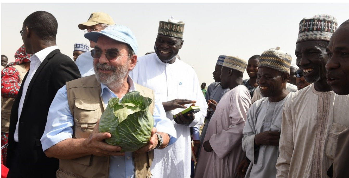
FAO Director-General José Graziano da Silva visits a farm centre in Maiduguri, northeastern Nigeria

I t is imperative to immediately ramp up humanitarian assistance to hunger-threatened rural communities in the strife-torn Lake Chad Basin region, FAO Director-General José Graziano da Silva said during a visit to some of the affected areas in northeastern Nigeria.