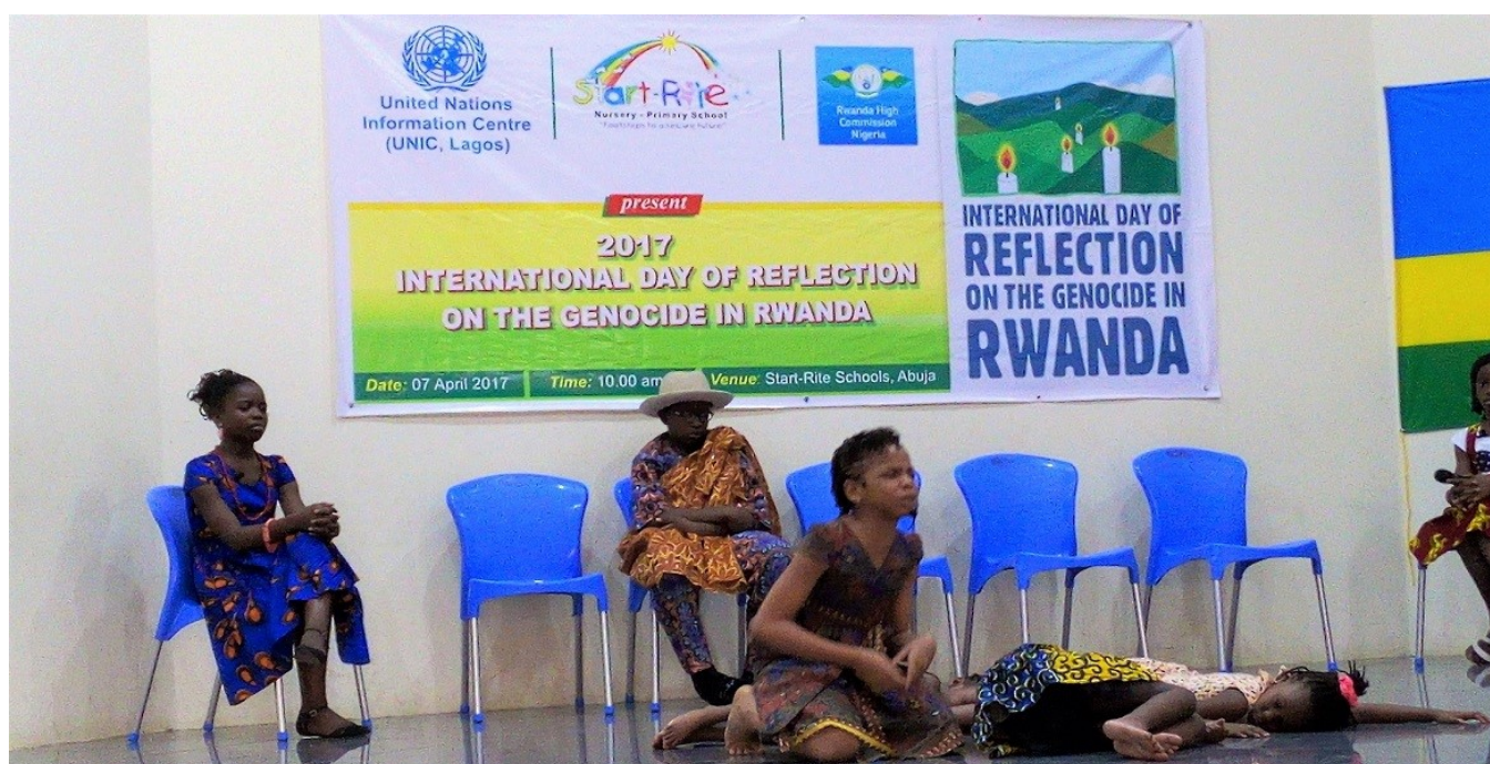
A drama sketch performance on the genocide in Rwanda staged by students of Start-Rite School, Abuja.

As the world marked the International Day of Reflection on the Genocide in Rwanda at the weekend, the United Nations Secretary-General Antonio Guterres has noted that preventing genocide and other monstrous crimes is a shared responsibility of all and a core duty of the United Nations. “The only way to truly honour the memory of those who were killed in Rwanda is to ensure that such events never occur again.” He said in a video message watched by 300 students and parents who had gathered in Abuja to mark the Day.