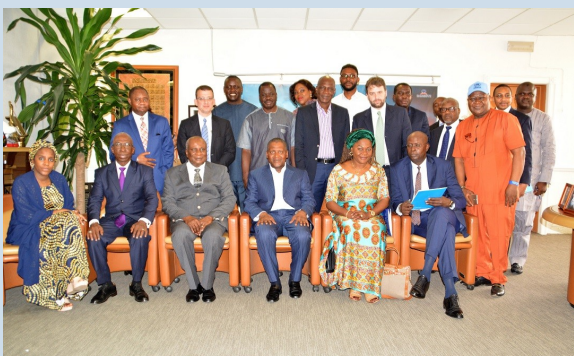
A group photograph of the UN Delegation and Dangote team members after an interactive engagement on the need for urgent intervention in North-East Nigeria.