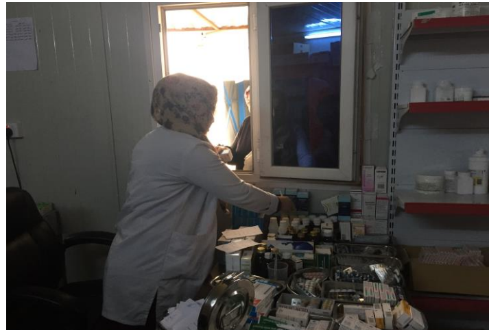
Department of Health-Erbil pharmacist is providing medication to patients, Kawergosk refugee camp PHCC, Erbil