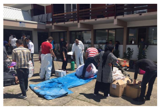
Reception of families and UASCs from Presevo RC at Vranje RC, Vranje (Serbia), 31 May 2017