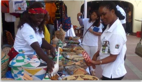
Refugees showcasing their craftsmanship during the commemoration of the World Refugee Day in Dar es Salaam.