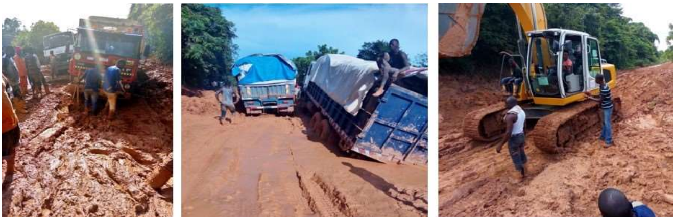
Some of the roads affected by heavy rains.