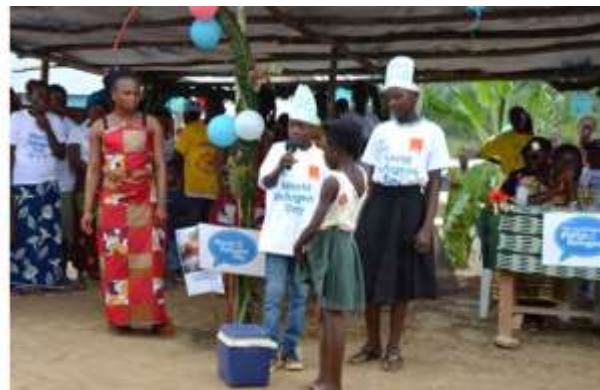
World Refugee day celebrations took place in Harper, Bahn and Paynesville. (Find here more images. Find here UNHCR Liberia Representative speech).