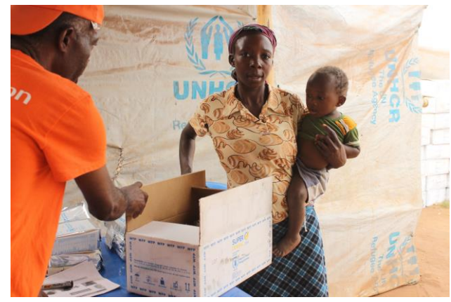
A mother and her child during the Super Cereal distribution.