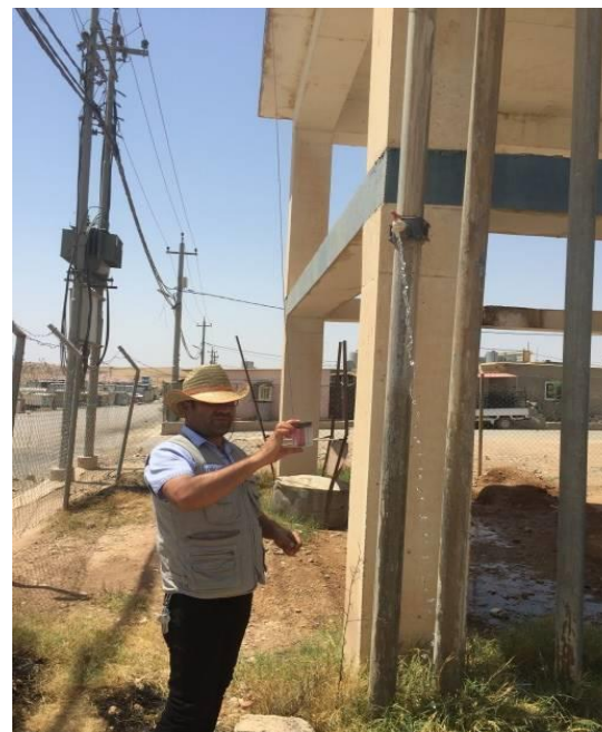
Water quality monitoring in Domiz refugee camp, Duhok.

Sulaymaniyah: Hygiene promotion: Door-to-door hygiene promotion sessions and focus group discussions (FGD) on diarrhoea prevention continued, targeting 2,119 families. UNHCR is coordinating with the directorate of electricity to provide 24/7 hrs of electricity to operate the borehole.