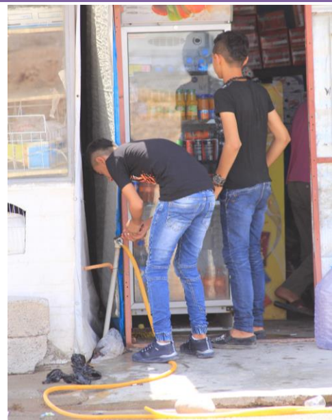
Kawergosk Refugee Camp, Extending water connection, Erbil.