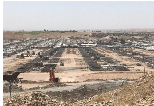
Shelter improvement, Kawergosk Camp, June 2017

Sulaymaniyah (Arbat Camp): UNHCR/QANDIL has supported refugees by providing 181 different tool kits inside the camp in order to rehabilitate their tents.