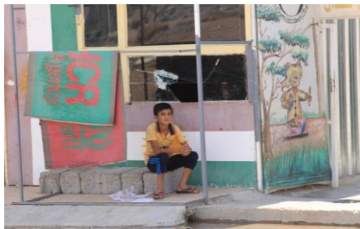
Kawergosk Refugee Camp, Erbil.

In view of the criticality of information dissemination on prevention and response to SGBV amongst the community, some 3,220 women and girls and 1,029 men and boys were reached during information campaigns.