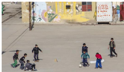
Child friendly space Akre camp, Duhok

UNHCR SGBV consultant along with a DCVAW legal advisor conducted a four-day training for 39 DCVAW staff from KR-I on case management and a refresher on GBV core concepts guiding principles and referrals.