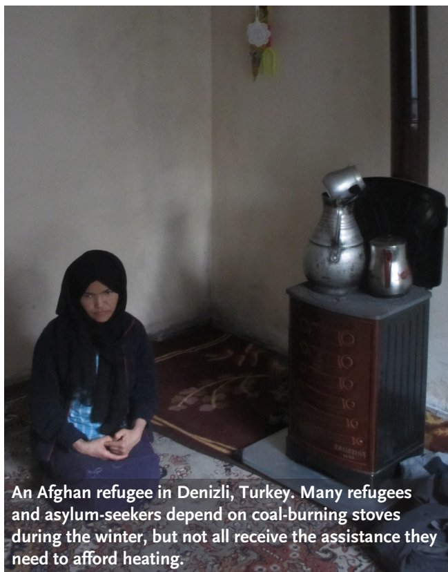
An Afghan refugee in Denizli, Turkey. Many refugees and asylum-seekers depend on coal-burning stoves during the winter, but not all receive the assistance they need to afford heating.

While the winterization program is an important effort to help refugees during the winter months, many people who need assistance are excluded from its scope due to the limited number of beneficiaries and to the exclusion of asylum-seekers. As for the other eligibility criteria, most of the refugees and asylum-seekers of non-Syrian nationality interviewed by RI fell into at least one of those categories. The Turkish Government also has winterization programs which benefit some refugees and asylum-seekers, but these are also limited. Furthermore, while RI