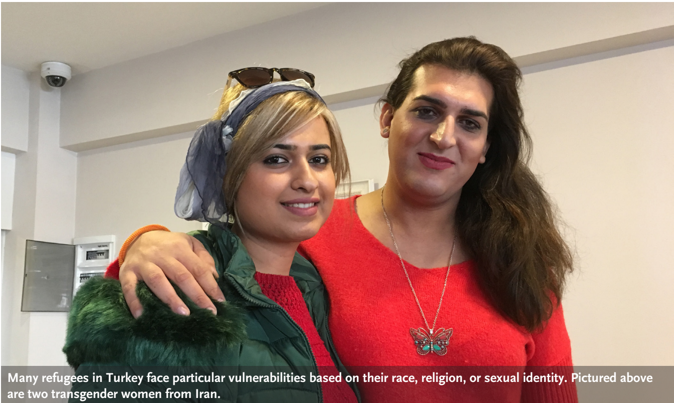
Many refugees in Turkey face particular vulnerabilities based on their race, religion, or sexual identity. Pictured above are two transgender women from Iran.