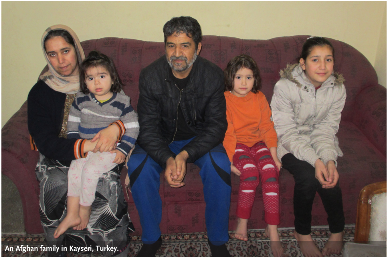
An Afghan family in Kayseri, Turkey.

was dressed as a woman. “Ten days after I came to Turkey, I was forced to live like a boy again... I understood no one will rent a house to me, so I changed to boy’s clothes. Within one hour, they gave me a room. It made me feel awful,” she said.