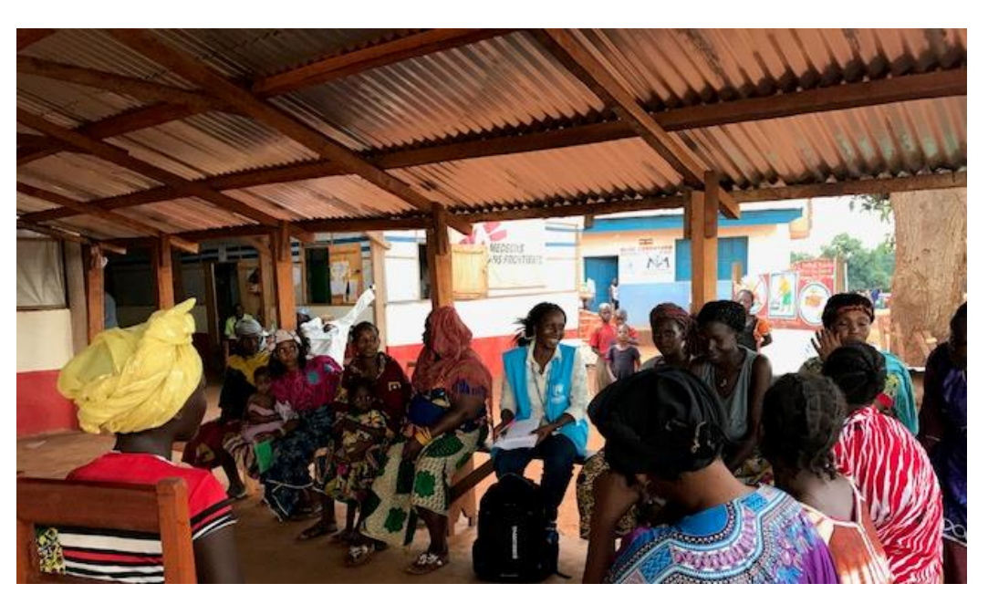
UNHCR Staff conduct focus group discussions at the Hospital IDP site in Bria.