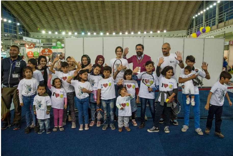
Refugee children from Krnjaca Asylum Centre participated in the Belgrade Children Fair Friday, 06-08 Oct October, on invitation of the Belgrade Tennis Association, (Serbia), 08 October 2017