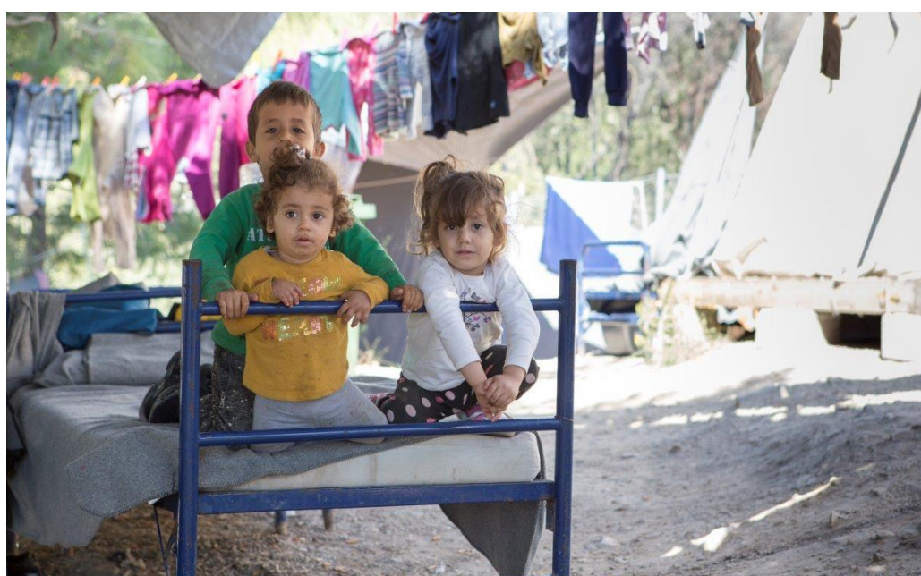
Refugee children in Vathy RIC, Samos.

1 Islands Unit in Athens 1 Sub Office on Lesbos 5 Field Offices on Chios, Samos, Kos, Leros and Rhodes