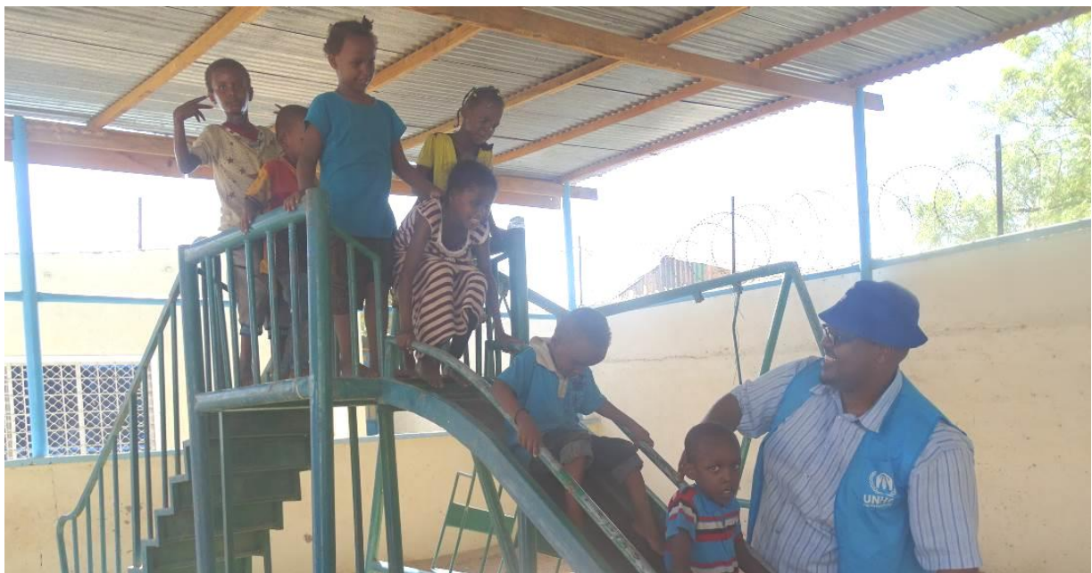
A UNHCR staff taking care of wellbeing of the Somali refugee returnees while waiting for further assistance by UNHCR at the Reception Centre in Berbera. © UNHCR/Berbera, October 2017