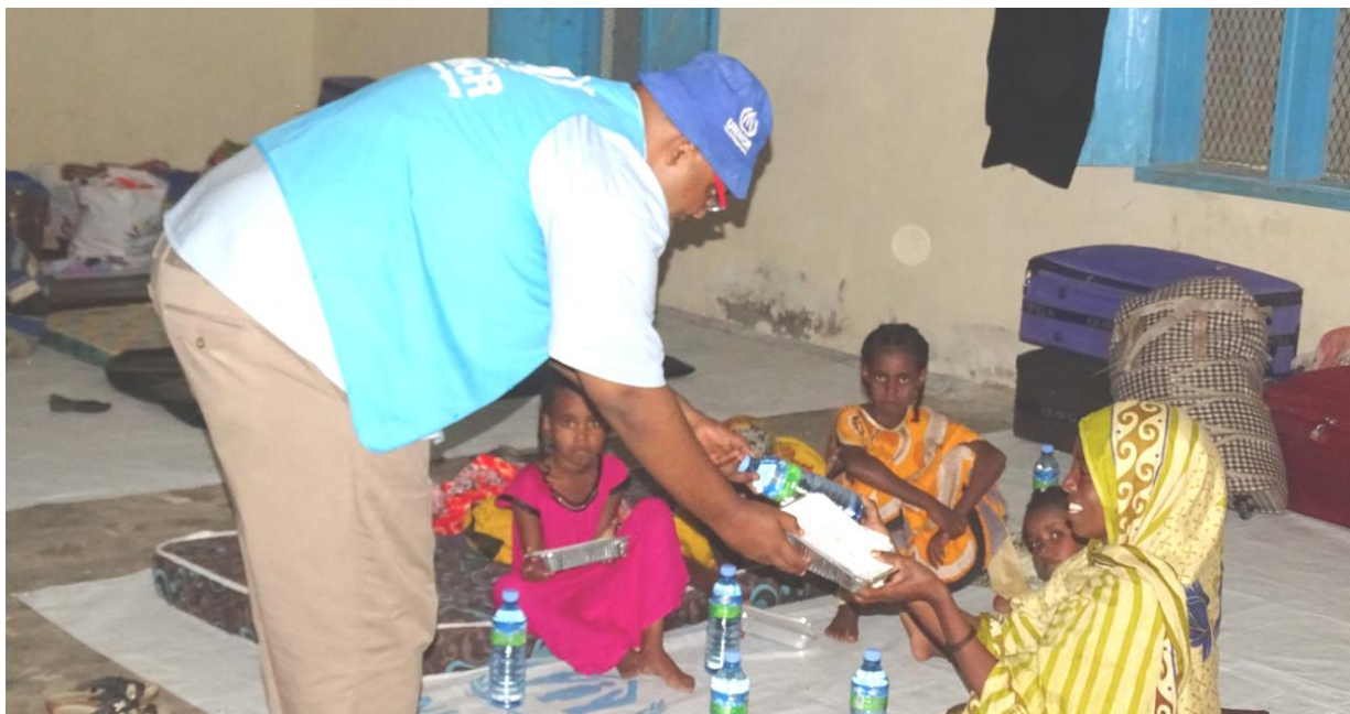
A UNHCR staff providing hot meal and water to Somali returnees at the Reception Centre at the Port in Berbera. © UNHCR/ Berbera, October 2017