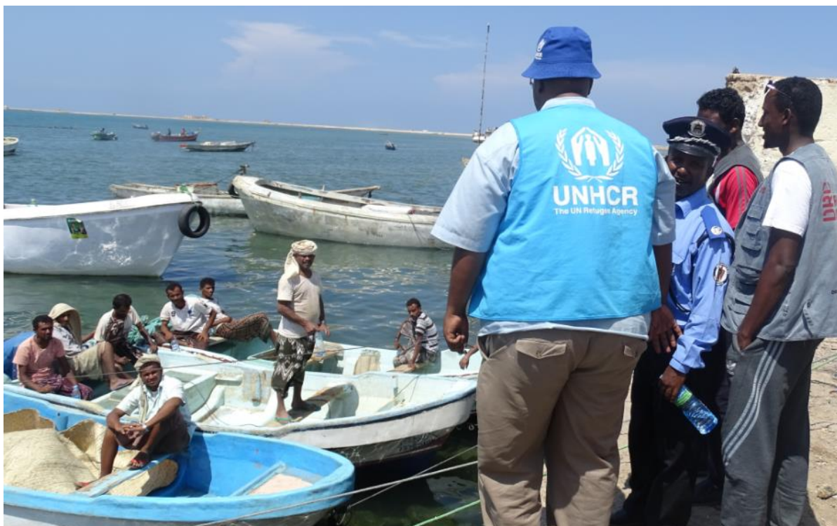
A UNHCR staff at the Port in Berbera upon arrivals of Yemeni refugees to assess the situation and assist new arrivals with the initial help.