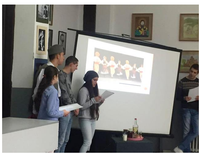
International Day of Tolerance celebrated at Trade High School in Vranje with local and refugee children, Vranje (Serbia), ©UNHCR, 16 November 2017