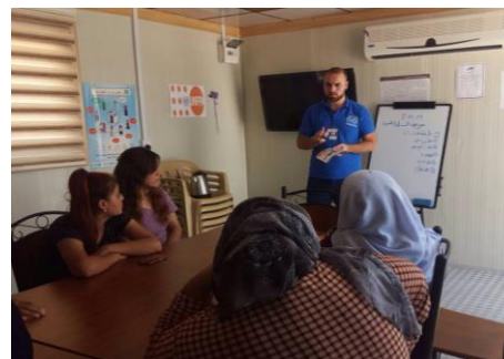
Health awareness by IOM in Akre settlement, Duhok