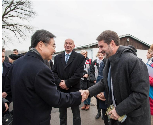
Visit of Mr. Cho Hyun, Vice Minister of Foreign Affairs of the Republic of Korea to Krnjaca AC, (Serbia), UNHCR@05 Dec 2017