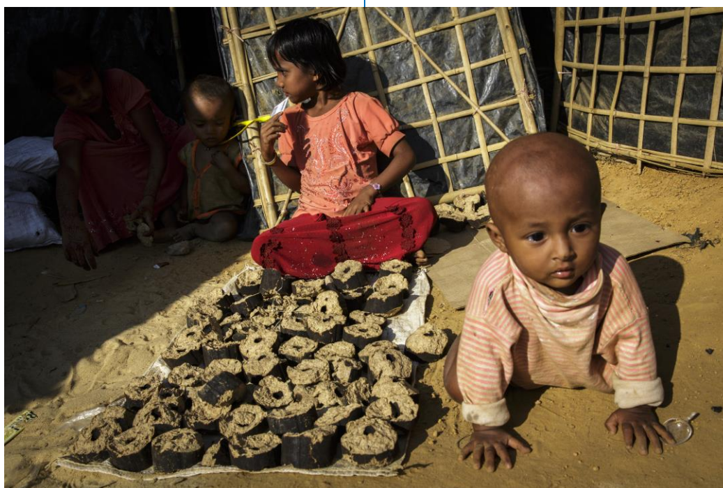
Compressed rice husks are dried in the sun in Kutupalong refugee camp, Bangladesh. The fuel is used to cook with and is a sustainable alternative to wood cut from the forest.