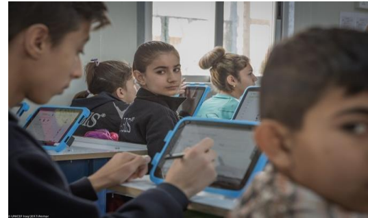
An e-learning program class at a school in Dohuk Governorate, Iraq

54 female members of parent-teacher associations (PTAs) were trained on school management and development plans.