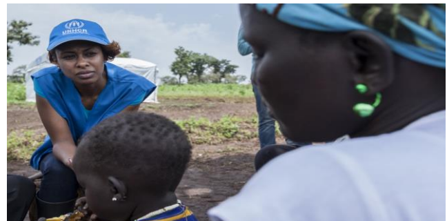
UNHCR High Profile Supporter Betty G interacting with South Sudanese refugees in Gure-Shembola camp.

1 Branch Office in (Addis Ababa), 2 Field Offices-Sherkole and Mekelle, 5 Sub-Offices-Melkadida, Gambella, Shire, Assosa and Jijiga