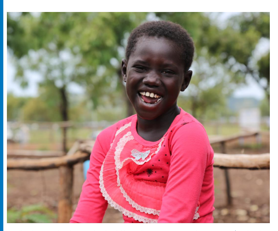
All smiles- a South Sudanese girl at the Child Friendly Space in Nguenyyiel camp.