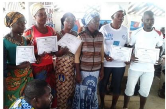
WASH handover ceremony and technicians with their certificates.