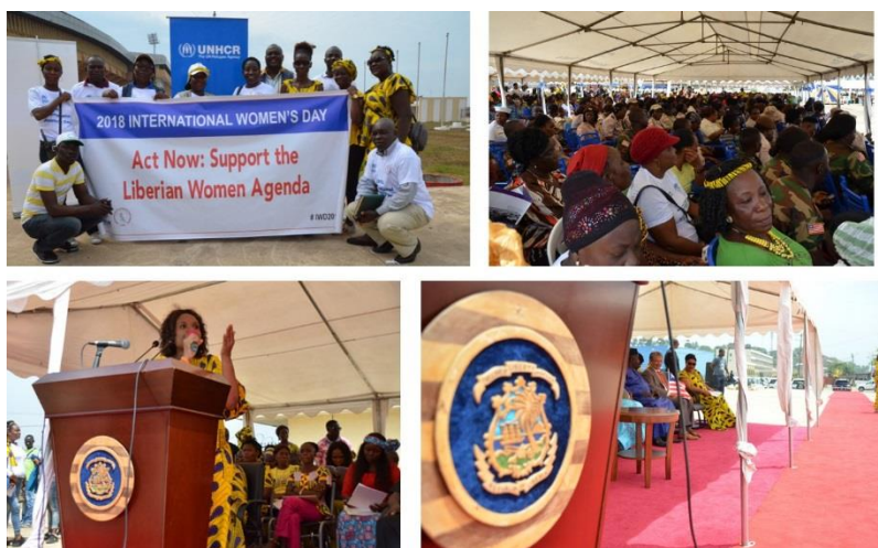
Celebrations of the International Women's Day at the Samuel Kanyon Doe Sports Complex in Monrovia.