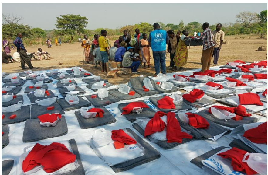
Distribution of core relief items in Bazia, Western Bahr el Ghazal - UNHCR