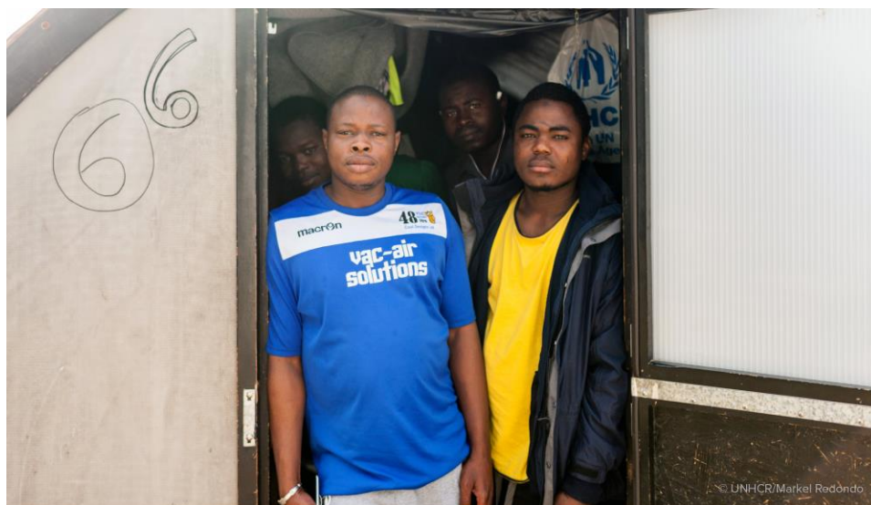
Vathy reception centre on Samos.