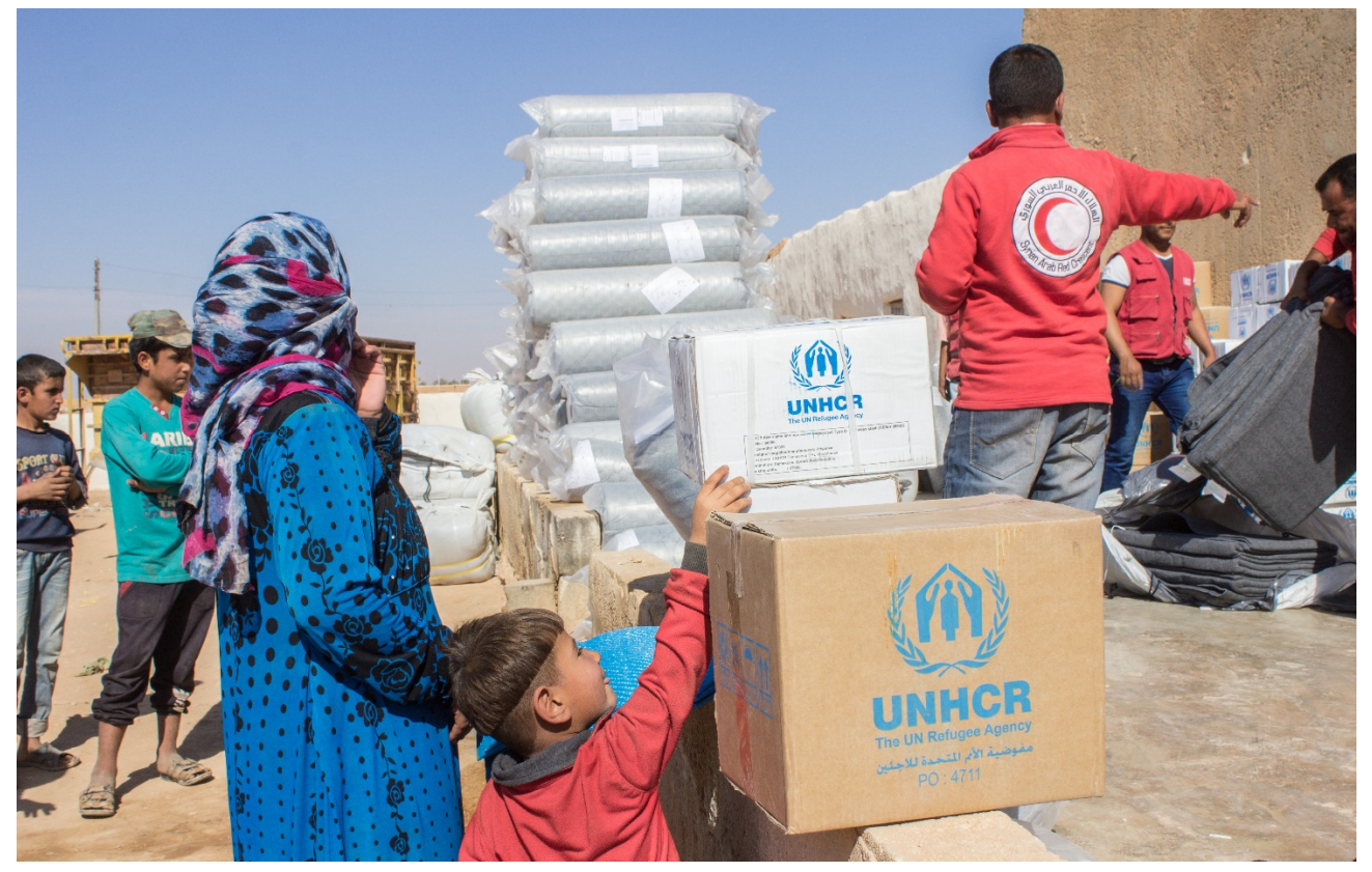
Returning families receive their winter core relief items distributed by UNHCR in east Aleppo, Syria, October 2017.

In addition to partner post distribution monitoring, UNHCR hired a third party for at site distribution monitoring and post distribution monitoring. The monitoring found that an overwhelming majority (99.5%) of the survey respondents found the items in the kit useful, with high thermal blankets, solar lamps, and plastic tarpaulins were most useful, Over 91.2 per cent respondents found the items to be of good quality.