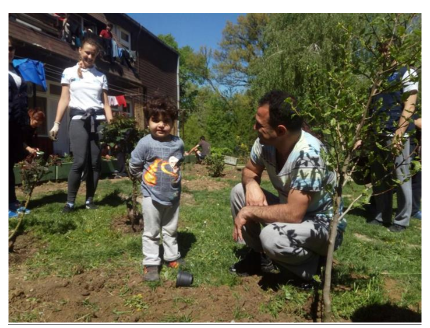
On the occasion of World Earth Day, trees and flowers were planted in the TC Principovac, Principovac (Serbia), ©UNHCR, 20 April 2018