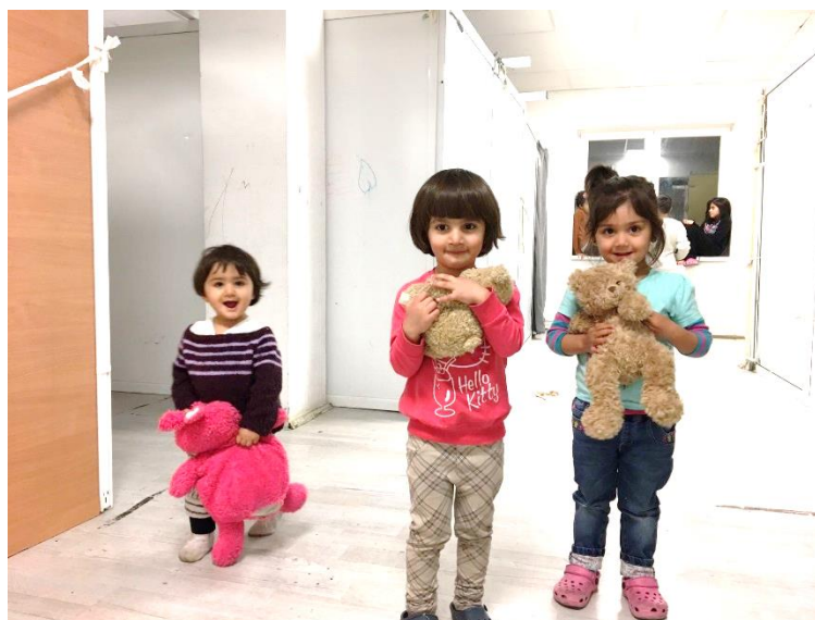
Children in Vranje Reception Centre (Serbia), @UNHCR, 19 February 2018

269 asylum-seekers were admitted into procedures in the so-called “transit-zones” of Hungary (compared to 816 in Jan-March). Sixty-one migrants were assisted through assisted voluntary return (AVR).