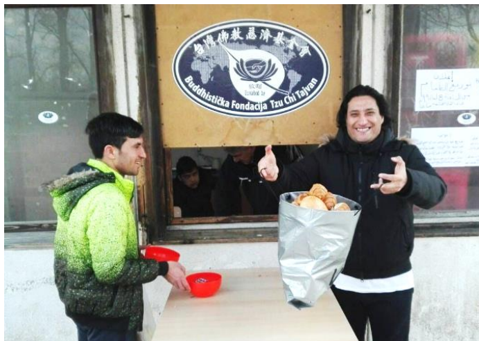
Distribution of pastry in Krnjača AC, Belgrade, Serbia, @Tzu Chi, March 2018