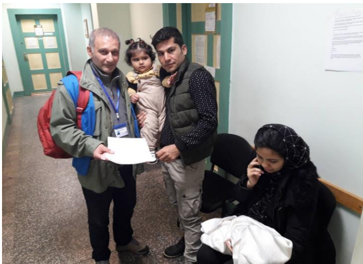
Thanks to UNHCR's partner HCIT, another refugee baby birth was duly registered in Subotica Registry Office (Serbia), 26 March 2018