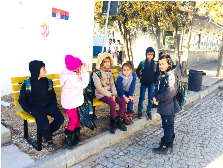
Children awaiting transport to school, Preševo (Serbia), @UNHCR, 5 February 2018