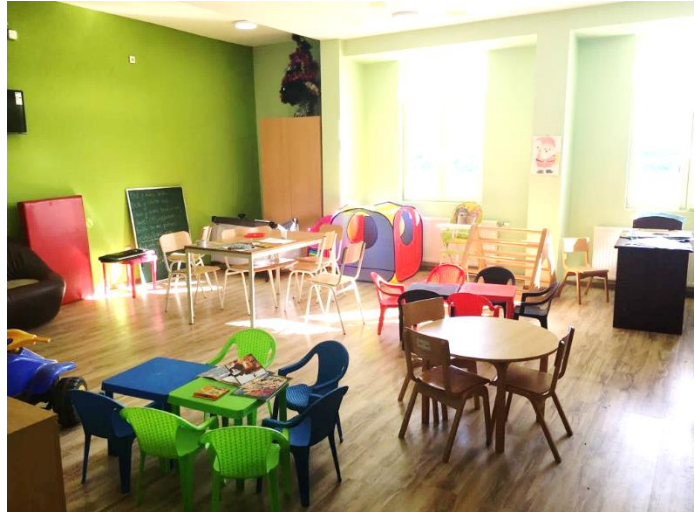
Child-Friendly Space in the new Tutin Centre building (Serbia), @UNHCR, 19 March 2018