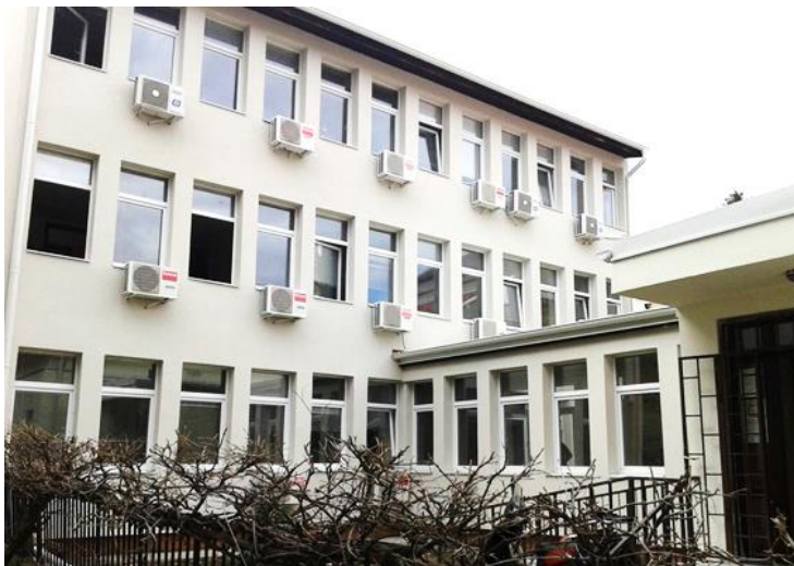
New exterior of Voždovac Social Welfare Centre @UNDP, February 2018

reconstruction of Voždovac Centre for Social Welfare, providing bolstering quality of social welfare services for both local and migrant/refugee beneficiaries in need for social protection. Along with the roof and façade renovation including the replacement of asbestos roof cover, prevention of leaking and proper energy efficiency of the building, UNDP has renovated and refurbished designated premises for family visits under supervision. The overall investment value of 95,000 USD has created safe and conducive social protection environment for both social workers and 1,100 beneficiaries on a yearly level.