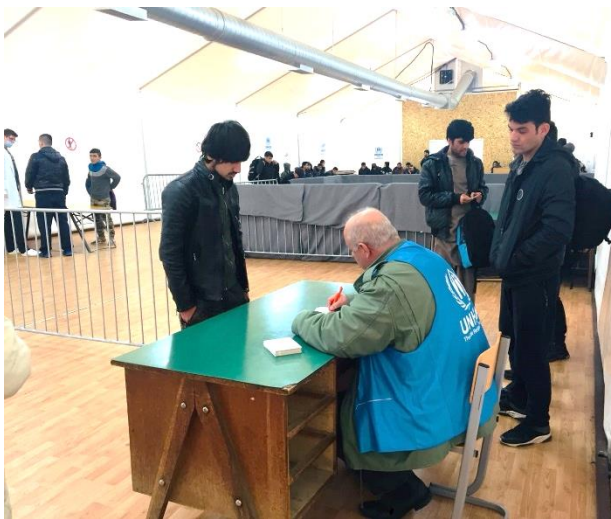
Profiling of new arrivals to Preševo Reception Centre (Serbia), @UNHCR, 21 February 2018