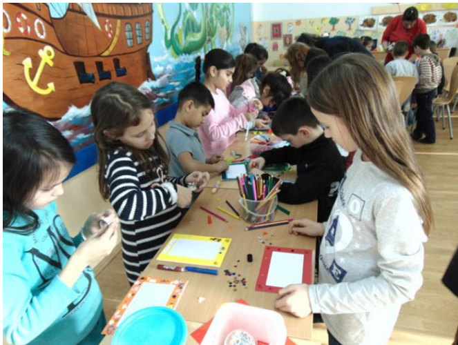
SOS CV mobile team "Super Bus" in "Duško Radović" Primary School in Pirot (Serbia), March 2018