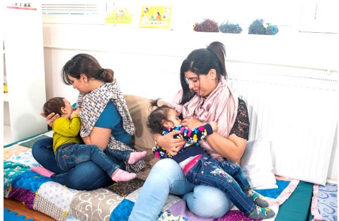
Mothers breastfeeding their children in UNICEF-supported MBC in Bujanovac, Serbia, © UNICEF Serbia/2018/Pančić