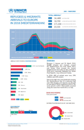
Mediterranean arrivals to Europe January to March 2018 Summary of arrivals to Europe via the Mediterranean.

Summary of population statistics including asylum applications and observed pushbacks.