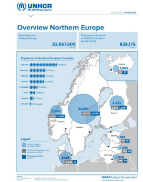
<u>UNHCR Northern Europe</u> <u>Country Factsheets</u> Key data on persons of concern in Northern Europe.

Mediterranean: Dead and Missing at Sea - April 2018 Number of dead and missing in the Mediterranean by route.