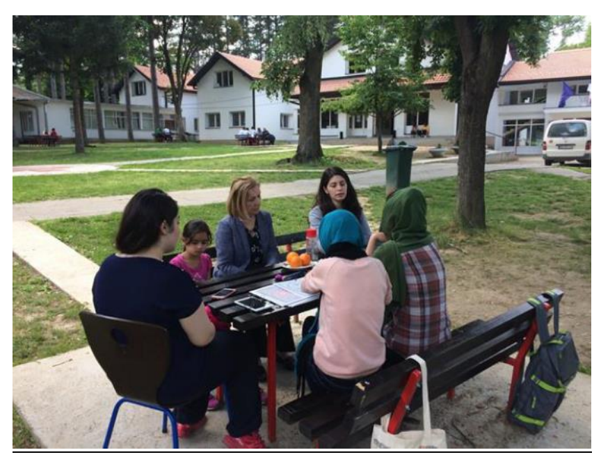
UNHCR Partner PIN conducting life-skill counselling in Bogovađa Asylum Centre